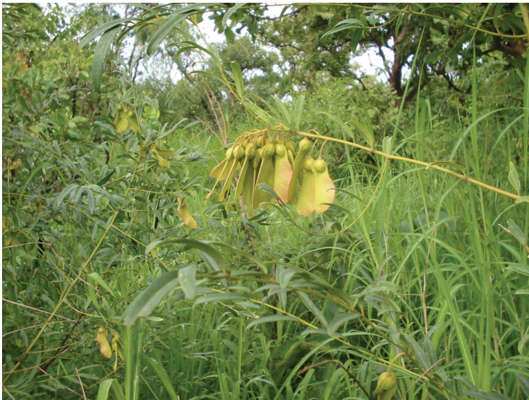
Figure 3. Securidaca longepedunculata - Albizia malacophylla community in woodland vegetation of BGRS, western Ethiopia (July 2004, 22 km along the road from Asosa to Kurmuk).