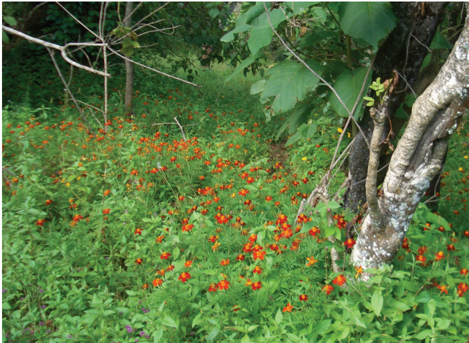
Figure 4. Escape population of Tagetes patula in semi-natural woodland vegetation of BGRS, western Ethiopia (October 2005, 82 km along the road from Chagni to Wembera).

The result of fire treatment experiment revealed that the diaspores of Bidens prestinaria were not affected by the different heat treatments. Being an indigenous species in fire prone area, B. prestinaria might have been adapted to woodland fire regimes through evolution. Zinnia elegans showed a higher germination frequency except the highest temperature treatment. This suggests that Z. elegans diaspores have a higher fire resistance, which might be connected to the fact that it has thick cypsela wall. The diaspores of T. patula were not affected by fire, unless the heat becomes excessive. Based on these findings, the pristine woodlands, which are adapted to fire, may not be at risk of invasion.