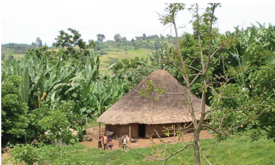
Figure 6. Ensete ventricosum dominated homegarden of Kafficho people in southwestern Ethiopia (Photo: Tesfaye Awaw June 2004, 8 km along the road from Wacha to Bonga).

The forest vegetation in Kafa zone was relatively intact a few decades ago, but recently faced heavy pressure from human activities (Kumelachew Yeshitela and Tamrat Bekele 2002; Kumelachew Yeshitela and Taye Bekele 2003). With the present ecological and socio-economical changes, medicinal plants together with the associated ethnobotanical knowledge of Kafficho are under serious threat and may be lost faster than imagined. Under such circumstances the use of plants for medicinal purposes will also decline and consequently the once effective traditional health care system will also be lost. Some ways to conserve the medicinal plants and associated knowledge were recommended in Paper VII .