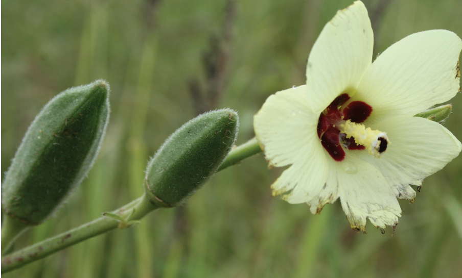
Figure 5. Abemoschus ficulneus under domestication in BGRS, western Ethiopia (October 2005, Guba).

The medicinal plants are always cultivated on the upper slope of the homegarden, specifically behind the house. Kafficho people give four reasons for this: to prevent contamination by discharge of animal waste in the lower slope of their house, protection from livestock and to grow them out of human sight. The latter is related to traditional belief. The fourth reason is related to plant nutrition and the consequent plant performance. If medicinal plants are grown in homegarden quarters with high soil nutrient, they grow faster, complete their life cycle within a relatively shorter period and then die – a situation not appreciated by farmers. Instead, the farmers want the medicinal plants to remain longer in their gardens so as to ensure a prolonged harvest, and they achieve this by maintaining the plants under stressed conditions that subdue plant growth.