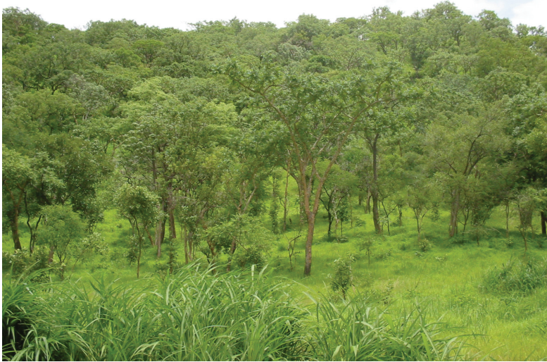
Figure 2. Boswellia papyrifera - Pterocarpus lucens community in woodland vegetation of BGRS, western Ethiopia (Photo: Tesfaye Awas July 2004, 83 km along the road from Asosa to Kurmuk).