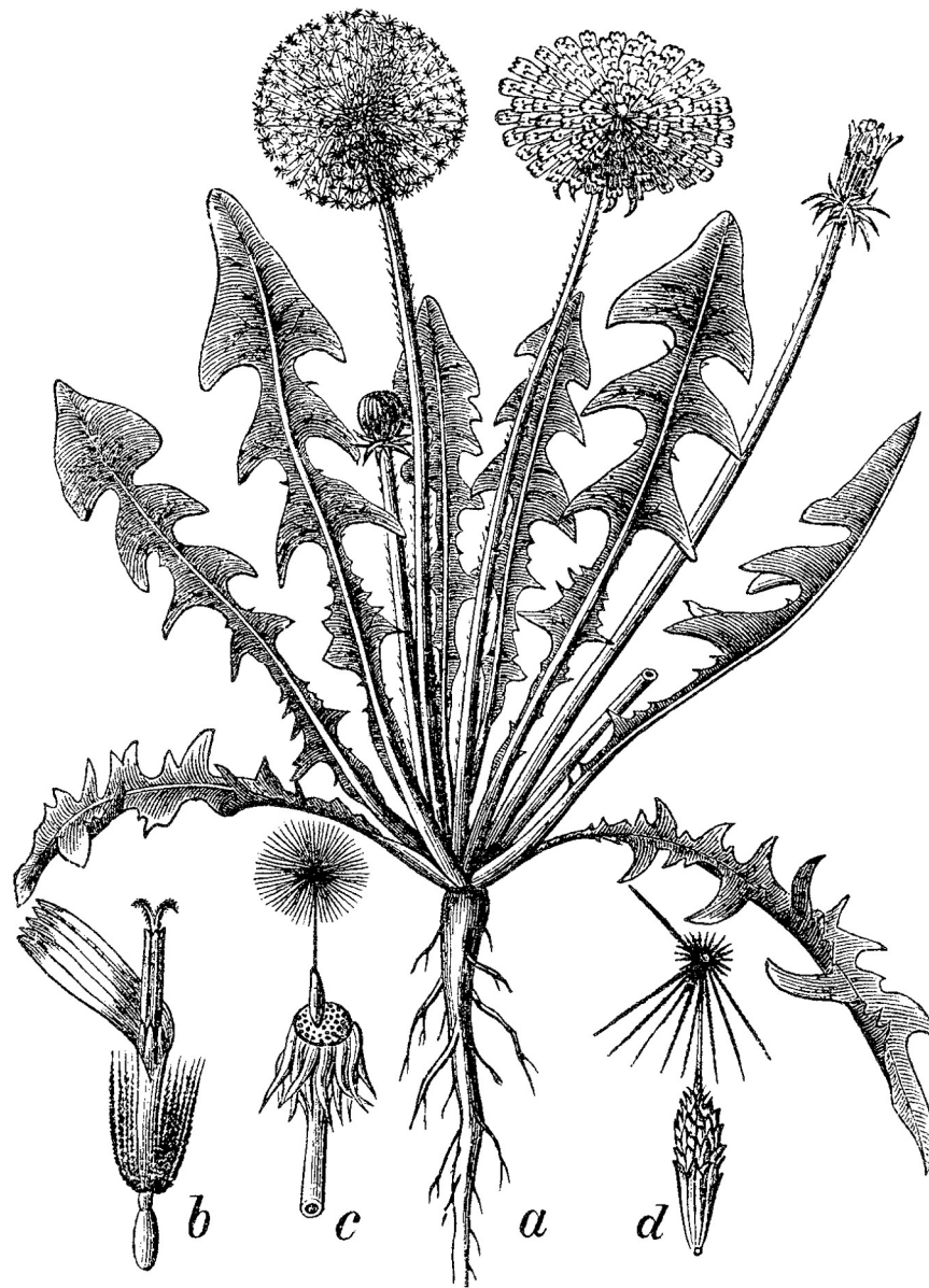
Taraxacum officinale (Aphaka, Blow-ball, Cankerwort, Caput monach, Couronne de moine, Dandelion, Doonhead, Grunsel, Irish daisy, Lion's tooth, Milk gowan, Monk's head, One-o'clock, Papencruitz, Pissabed, Puffball, Swine's snout, Wild endive, Witch gowan)