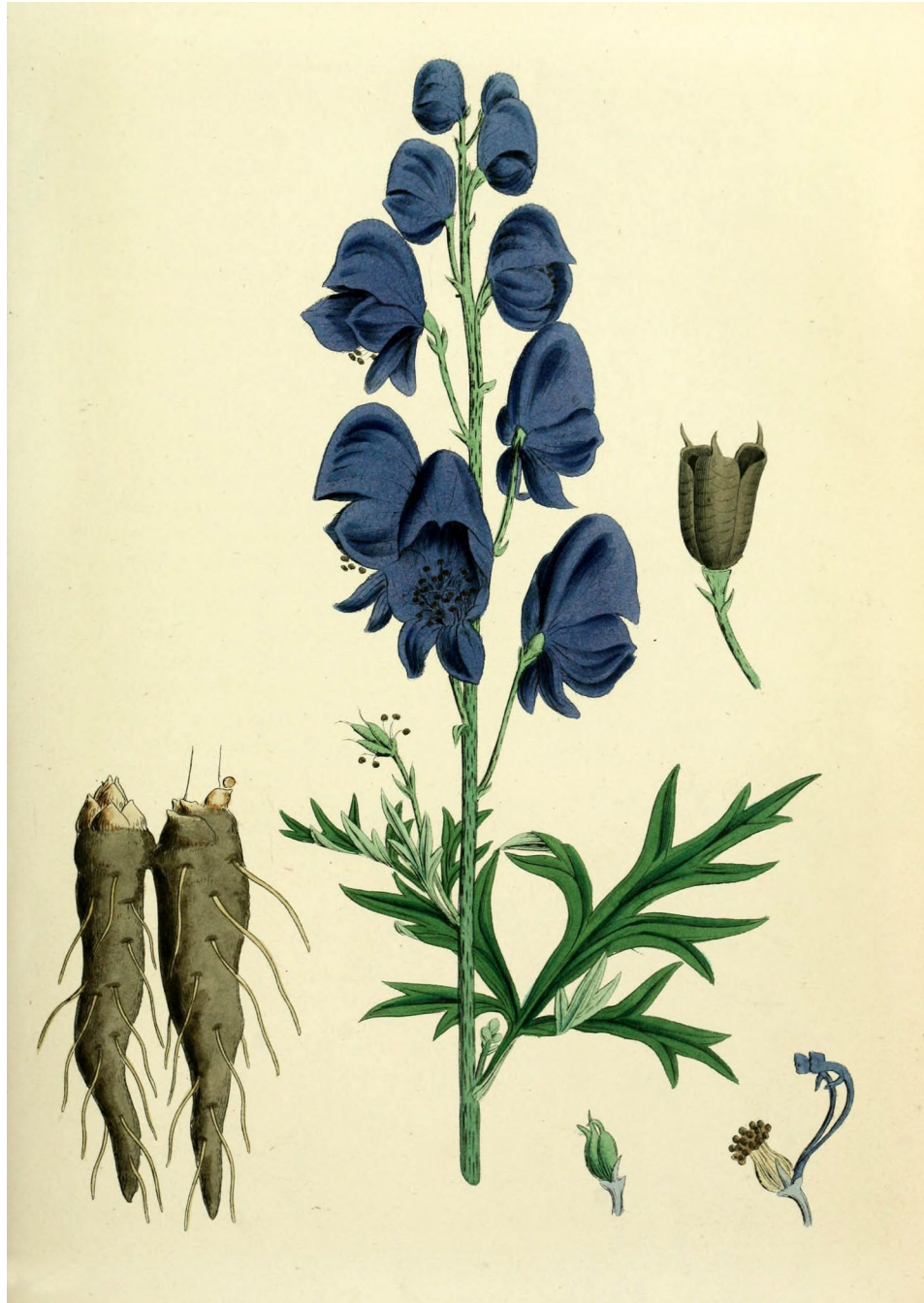
Aconitum napellus (Aconite monkshood, Adam-and-Eve) [J.E. Sowerby, 1863]