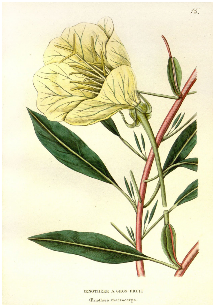
Ozark sundrops, Oenothera macrocarpa Nutt. ( Annales de flore et de pomone , v. 2, 1833-1834)