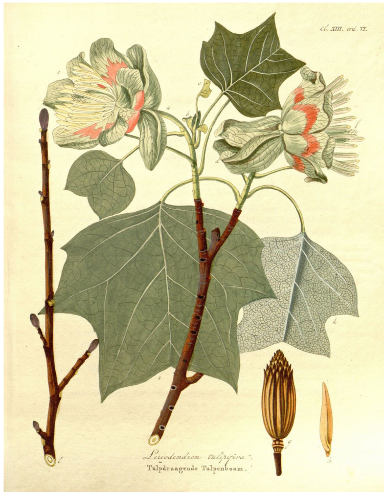
Tzue-u or Tulip poplar, Liriodendron tulipifera L.