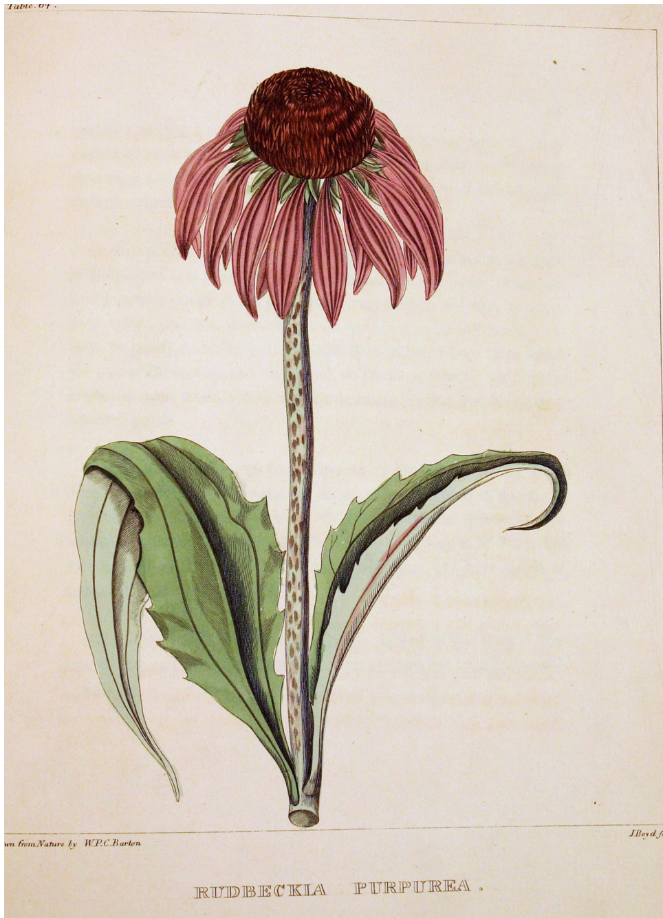
Echinacea purpurea [ Rudbeckia purpurea ] (Purple coneflower, Red sunflower) [W.P.C. Barton, 1823]