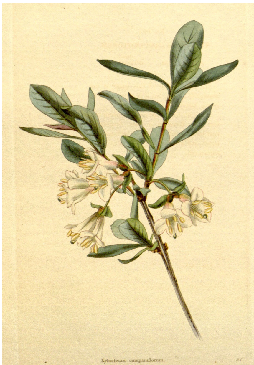
Xylosteum , Lonicera xylosteum L. (as Xylosteon campaniflorum Lodd.) (G. Cooke, 1827)

Xylosteum - Lonicera xylosteum L. (174) (1753)