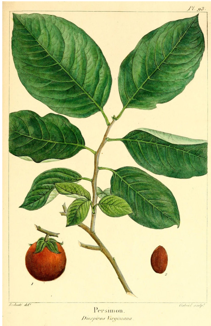
Diospyros virginiana (Date-plum, Guajacana, Jove's fruit, Lotus tree, Medlar, Mespila, Ougoufle, Persimmon, Piakmin, Pishamin, Plaqueminier, North American ebony, Winter plum, Yellow plum, Θta-iηge) (P.J. Redouté, 1817)

Θta-iηge (Osage) - Diospyros virginiana L. (121) (1918?–1970?)