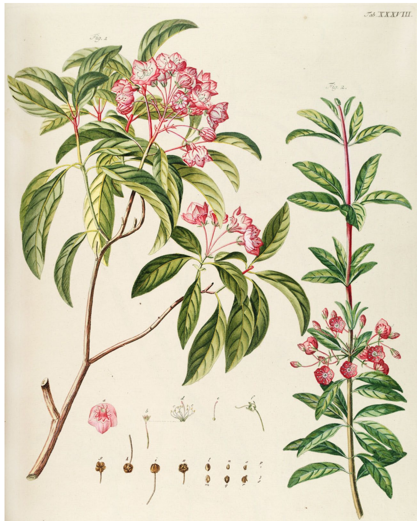
Ivy tree, Kalmia angustifolia L. (G.D. Ehret, 1754)

Ivy-leaf morning-glory [Ivyleaf morning-glory, Ivyleaf morning-glory, Ivy-leaved morning glory, Ivy-leaved morning-glory] - Ipomoea hederacea Jacq. (3, 4, 5, 50, 62, 72, 85, 93, 97, 131, 138, 155, 157) (1899–present) Ivy-leaf rough bindweed [Ivy leaved rough bindweed] - Smilax glauca Walt. (8) (1785) Ivy-leaf speedwell [Ivyleaf speedwell, Ivy-leaved speedwell] - Veronica hederifolia L. (3, 4, 5, 50, 155, 156, 158) (1900–present) Ivy-leaf toadflax [Ivy-leaved toad flax, Ivy-leaved toadflax] - Cymbalaria muralis P.G. Gaertn., B. Mey. & Scherb. (5, 92, 156) (1876-1923) Ivyweed [Ivy weed] - Cymbalaria muralis P.G. Gaertn., B. Mey. & Scherb. (5, 156) (1913-1923) Ivywood [Ivy wood] - Kalmia latifolia L. (71) (1898) Iwarancuse - Vetiveria zizanioides (L.) Nash (92) (1876) Ixia - Ixia L. (138, 155) (1923-1942) Greek “bird lime” perhaps referring to juice Ixora - Ixora L. (138) (1923) Izna-kithe-iga hi (Omaha-Ponca) - Monarda fistulosa L. (possibly) (37) (1919)