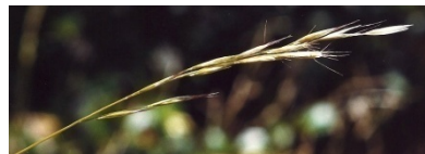
Striped Wallaby Grass

Awns on Wallaby Grass seeds are much finer and shorter than awns on Needle Grasses – see photos below.