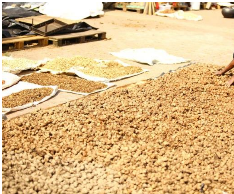
Figure 3: Siphonochilus aethiopicus tubers being dried at a traditional medicines market in Johannesburg, South Africa after they were off-loaded by a bulk trader from Zimbabwe. These tubers were wild harvested in Zimbabwe for “informal” export to South Africa.

Based on over a century of field observation, plus recent quantitative assessments of decline in S. aethiopicus populations in South Africa, there is little doubt that the cross-border trade in S. aethiopicus rhizomes from Swaziland and Zimbabwe to South Africa will contribute to continued population declines in both of those countries. In addition, localized and unsustainable depletion of S. aethiopicus populations may be occurring in southern Mozambique, also due to trade to South African traditional medicine markets. The extirpation of the species across its range in KwaZulu-Natal is attributed to harvesting for traditional medicine (local consumption and domestic trade in muthi markets), and the drastic declines in the remaining populations in the South African provinces of Limpopo and Mpumalanga are also attributed to harvesting for the traditional medicine trade. The demand for the species appears to be such that cultivated sources cannot supply the urban demand, hence plants are sourced from neighbouring countries – but the impact in these countries has not been fully assessed. One visit to a South African traditional medicine market in 2011 revealed thousands of plants harvested in Zimbabwe – which must have resulted in the extirpation (or near-extirpation) of that population at the harvesting source (Figure 3).