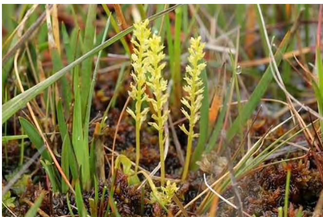
The elusive Hammarbya paludosa in its typical habitat with Narthecium ossifragum at Bowthick, Cornwall.

Individual plants have 2-3(5) oval, bluntly rounded pale green leaves that are deeply channeled and prominently veined (Harrap & Harrap 2005). The leaves enclose two pseudobulbs from which the flower spike arises, and the tips of leaves are