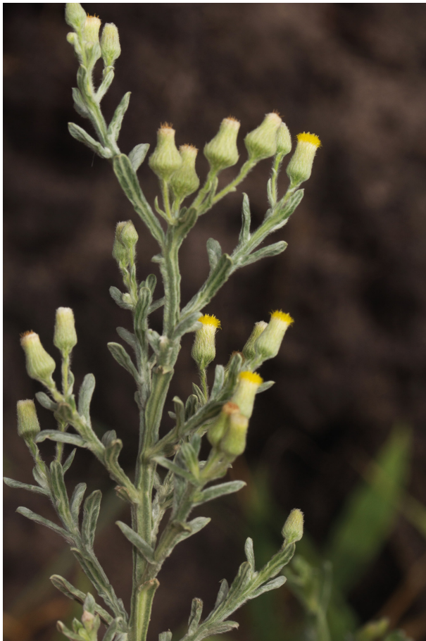
Fig. 6. Galgera decurrens – Namibia, Caprivi Strip, Bukalo, 31 Jan 2018.

This genus is a member of the Inuleae–Plucheinae related to, e.g., Nicolasia S. Moore and Doellia Sch. Bip. ex Walp. in the large “Pluchoid” clade mentioned above (Nylinder & Anderberg 2015; Fig. 2). Laggera species (Anderberg 1991) have winged stems or at least long decurrent leaf bases, florets with purple or pink corollas, and styles with obtuse sweeping-hairs extending below the bifurcation. Nylinder & Anderberg (2015) found that Laggera was polyphyletic as presently circumscribed because one of its species, viz. L. decurrens , belongs in a different clade within the subtribe. Apart from its distant relationships to other species of Laggera , L. decurrens also differs from them in morphology by having capitula with yellow corollas, tailed anthers with polarized endothelial tissue wall thickenings, and styles with acute sweeping-hairs ending above the bifurcation. It is here found as sister to Antiphiona close to the Geigeria–Ondetia and Calostephane–Pegolettia clades (Fig. 2). In Nylinder & Anderberg (2015) the Geigeria–Ondetia pair is sister to Antiphiona–Laggera decurrens . Like Antiphiona , these were formerly members of the Inuleae–Inulinae . They have florets with yellow corollas (purple with yellow tips in Antiphiona ), styles with acute sweeping-hairs ending above the bifurcation (below in Geigeria Griess.) and polarized endothelial tissue. In these respects, they correspond well with the character