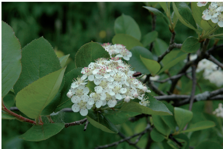
Fig. 1. Sorbaronia mitschurinii , flowering branch. – Cultivation, 29 May 2011.

In spite of the intergeneric origin, Leonard (2011) decided to maintain Aronia mitschurinii in Aronia because of its greater similarity to the species of the latter. However, an analogous case when variable intergeneric hybrids with Sorbus as one of the parents are accommodated in a single