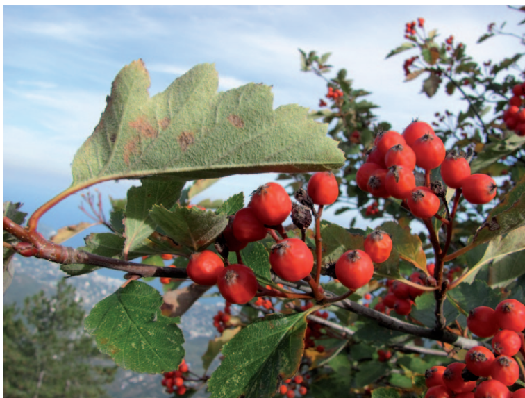
Fig. 6. Sorbus tauricola , fruiting branch showing the grey-green tomentose lower side of the leaves. – Crimea, Ai-Petri Mt, 25 Sep 2010. – Photo by P. Evseenkov.

ex Sennikov”; the name may not be attributed to Zaikonnikova alone under Art. 46.2.