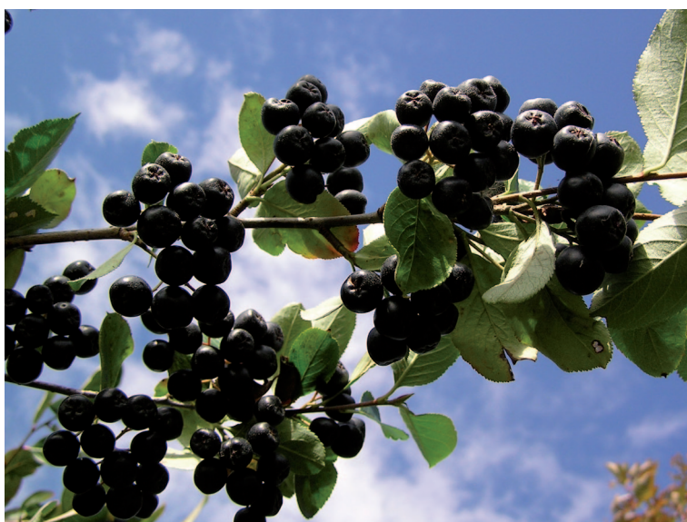
Fig. 2. Sorbaronia mitschurinii , fruiting branch. – Cultivation, 11 Sep 2004.

hybridogenous genus is Sorbocotoneaster Pojark. The natural hybrid between Sorbus aucuparia L. and Cotoneaster laxiflorus Lindl. (syn. C. melanocarpus (Bunge) Loudon), Sorbocotoneaster pozdnjakovii Pojark., was studied morphologically (Pojarkova 1953) and cytologically (Krügel 1992). Three distinct, yet sympatric, morphotypes were discovered: the primary hybrid (triploid) closely approaching S. aucuparia , the putative backcross with S. aucuparia (tetraploid) intermediate between the parents, and the putative backcross with C. laxiflorus (pentaploid) closely approaching C. laxiflorus . If it were not for the apomictic reproduction, A. mitschurinii would have been taxonomically included in S. fallax ; as far as its taxonomic separation is maintained, its transfer to Sorbaronia is justified and is consequently effected here.