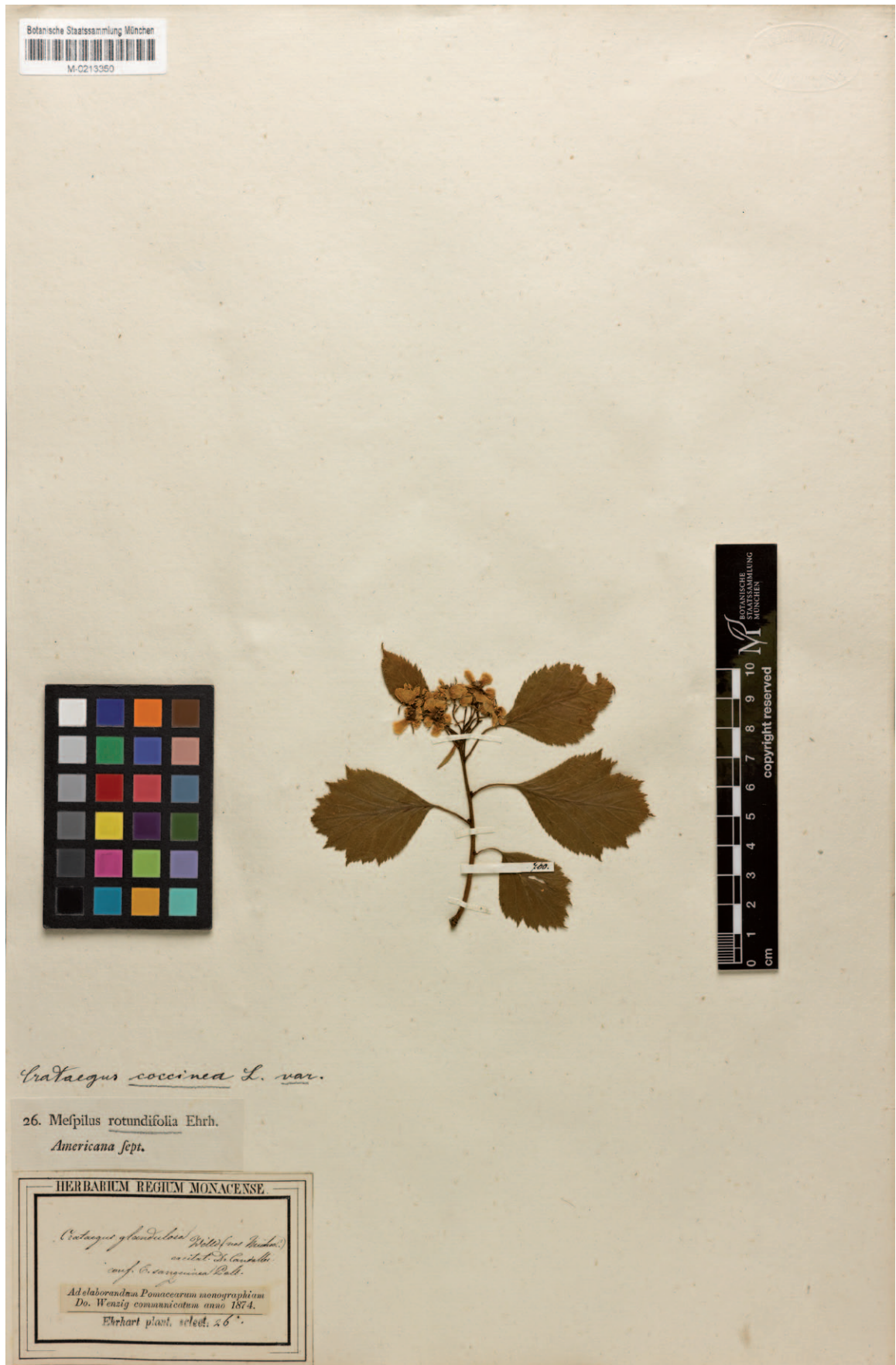
Fig. 3. Neotype of Mespilus rotundifolia – Ehrhart (1792), Plantae selectae hortuli proprii 3: No. 26 (M 0213350).