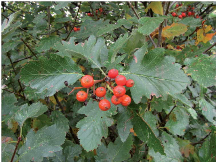
Fig. 5. Sorbus tauricola , fruiting branch showing the glossy upper side of the leaves. – Crimea, Ai-Petri Mt, 25 Sep 2010.

The Crimean whitebeams that belong to the apomictic complex of Sorbus latifolia (Lam.) Pers. s.l. were first discovered by Zelenetzky (1906), who identified them as “ S. scandica Fries”. Stankov (1927) reported the plant as S. latifolia . Popov (1959a) acknowledged the isolated occurrence of the Crimean plants and their difference from Central European whitebeams and described the Crimean populations as S. pseudolatifolia K. Popov. Popov provided an extensive description in Latin but designated two gatherings as types, one in flower and the other in fruit, making the new name not validly published under Art. 40.1. Zaikonnikova (1985) renamed the species because of homonymy but omitted the type designation, and this issue was also neglected in a recent list of Ukrainian type specimens (Fedoronchuk 2006). The name suggested by Zaikonnikova is in current use (Czerepanov 1995; Mosyakin & Fedoronchuk 1999; Zaikonnikova 2001; Yena 2012) and is validly published here. Under Art. 46.5 and 46.10 its authorship is “Zaik.