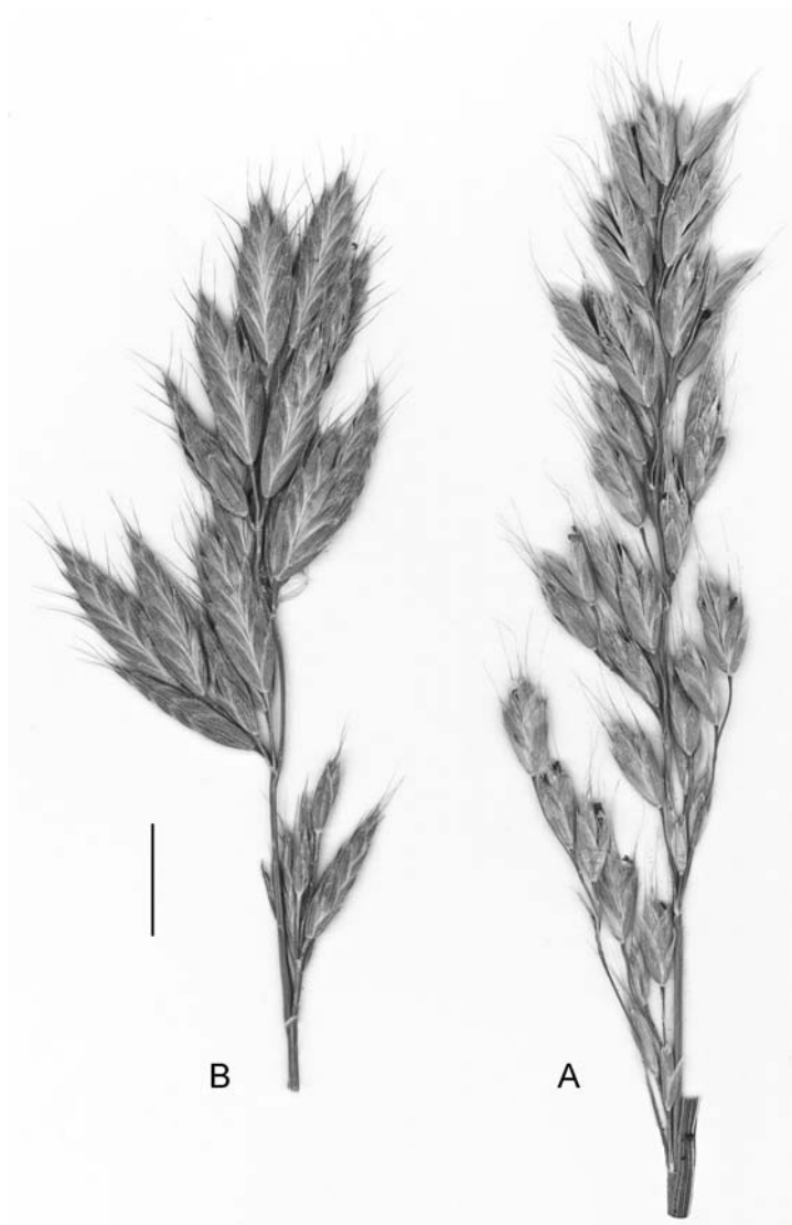
Fig. 1. A: Bromus parvispiculatus (from the holotype, Willing 87413). – B: B. hordeaceus subsp. mediterraneus (France, Var, 1860, F. Schultz, herbarium normale, nov. Ser. Cent. 13, No. 1272 as B. molliformis ). – Scale bar = 1 cm.

of glumes and lemmas on drying, a relative high lemma awn insertion of 0.5-1.7 mm below the obtuse or short-bilobed lemma apex as well as the more or less spreading, softly and densely long-hairy indumentum at least on the lower leaf sheaths (except for B. hordeaceus subsp. longipedicellatus , a probably hybrid derivative; Spalton 2001). The interrelationships of all these taxa are obscure. Some similarities in the loose panicle configuration of B. hordeaceus subsp. pseudothominei (6.5-8 mm long lemmas; the mostly non-weedy subsp. thominei , similar in lemma size, differs, e.g., by its compact inflorescences!) and B. parvispiculatus may one lead to the assumption that the latter is the Mediterranean vicariant of the more northerly distributed subsp. pseudothominei and should therefore better be treated as a subspecies of B. hordeaceus .