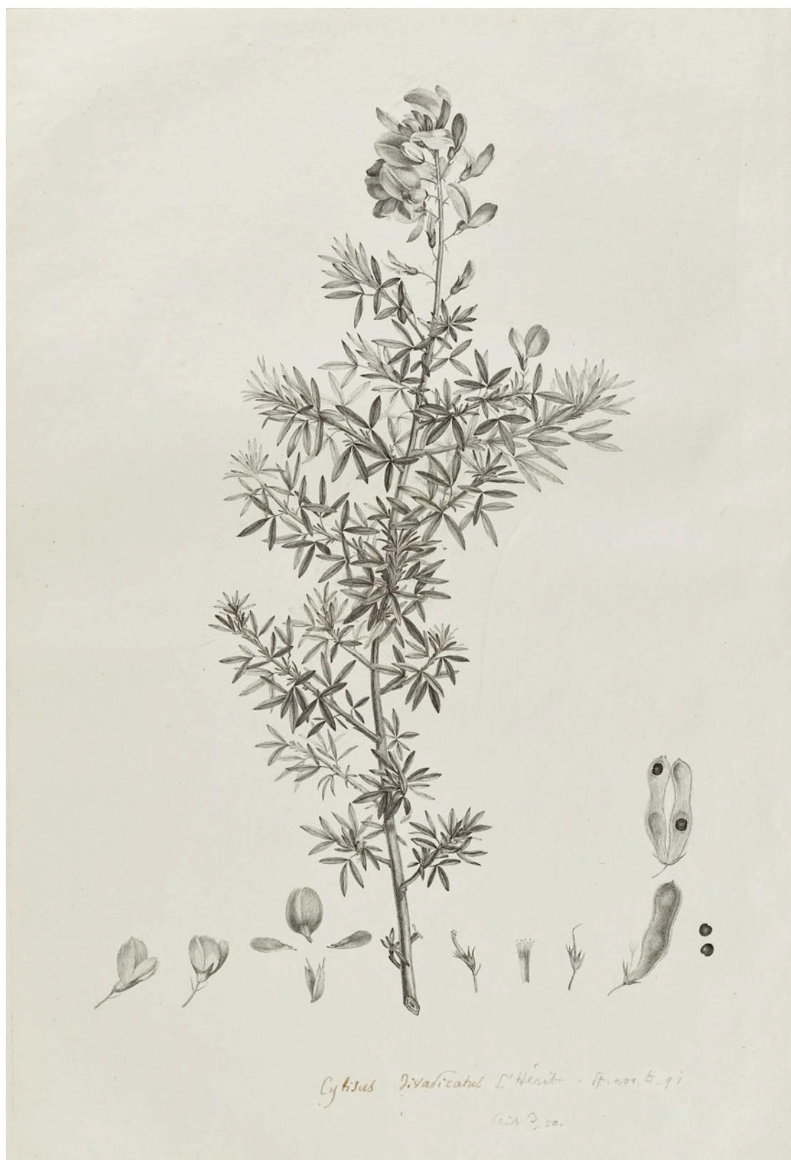
Fig. 4. – Cytisus anagyrius L'Hér. (= Adenocarpus hispanicus (Lam.) DC.). Copper engraving based on P.-J. Redouté, avant la lettre, no date. [L'Heritier's Reliquiae] [Bibliothèque, Conservatoire et Jardin botaniques de Genève]