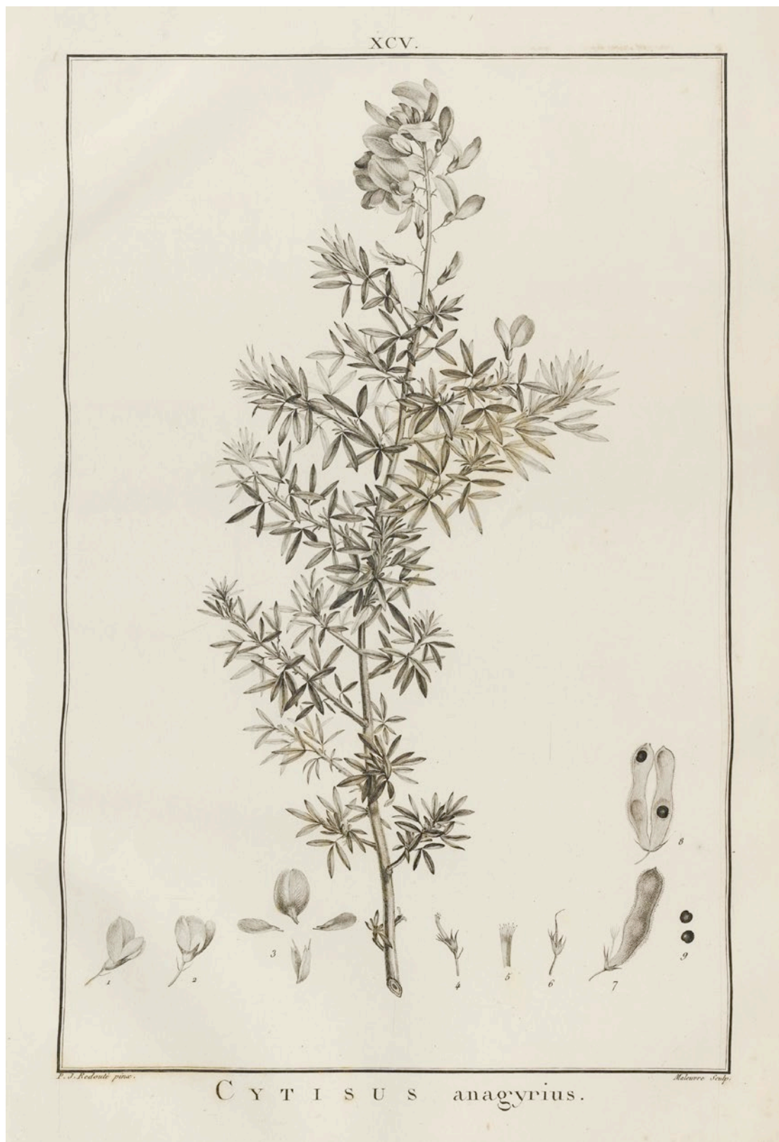
Fig. 5. – Cytisus anagyrius L'Hér. (= Adenocarpus hispanicus (Lam.) DC.). Copper engraving based on P.-J. Redouté, no date. [Tabulae ineditae: tab. 95]