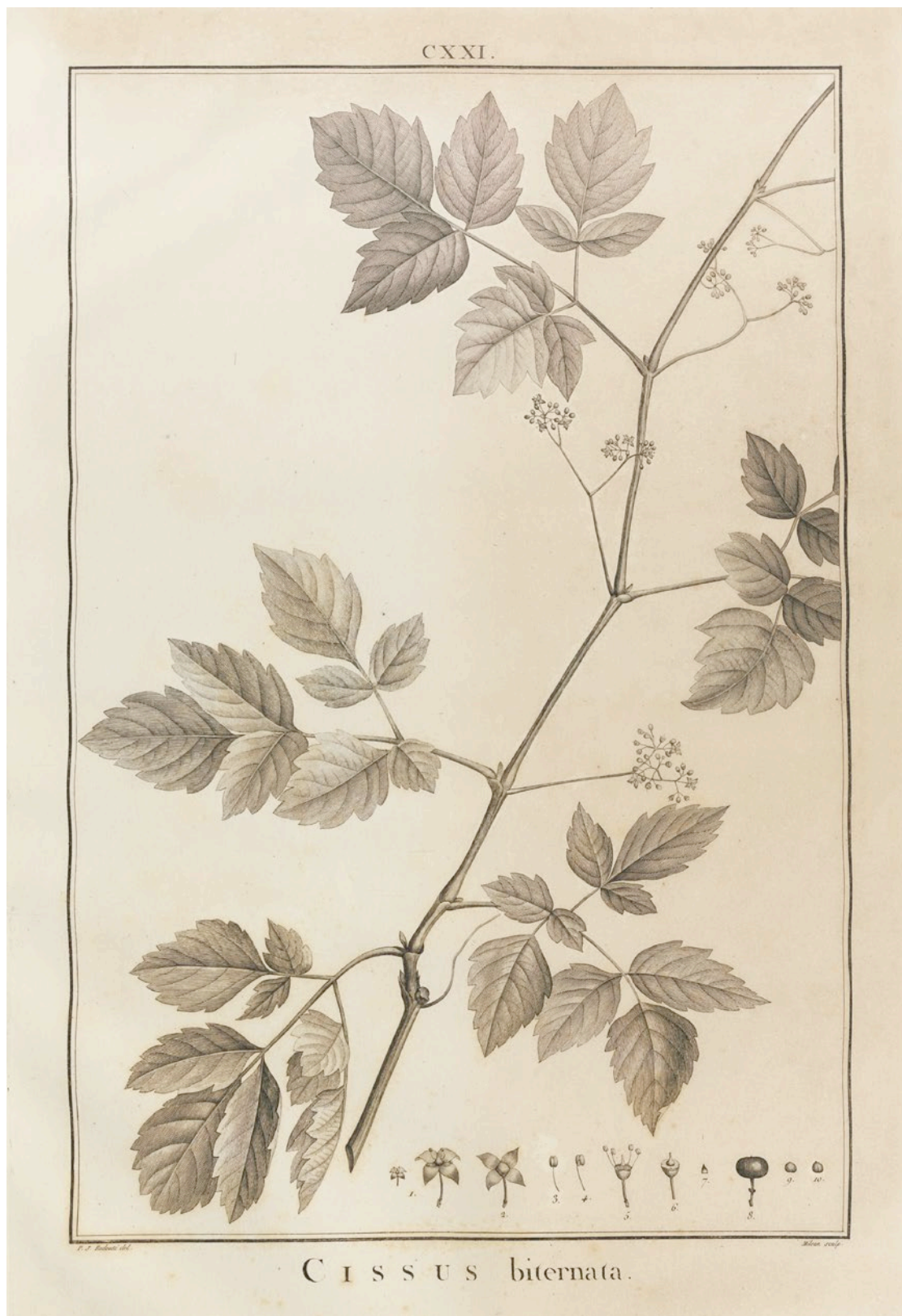
Fig. 9. – Cissus biternata L'Hér. Copper engraving based on P.-J. Redouté, no date. [Tabulae ineditae: tab. 121]