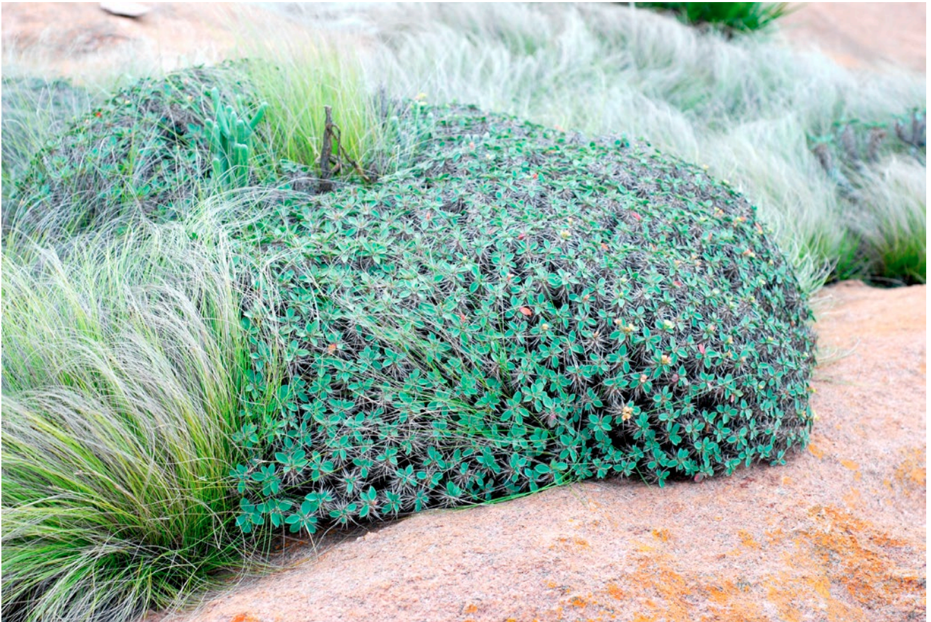
Fig. 4. – Euphorbia horombensis Ursch & Leandri ( Euphorbiaceae ) a succulent on open rocks at Vohitsanavo inselberg, Anja Park (Fig. 3: n° 23). [Razafindraibe et al. 278]

(B.S. Williams) Schltr., Angraecum pseudofilicornu , Oeceoclades calcarata (Schltr.) Garay & P. Taylor, Sobennikoffia humbertiana ) were present.