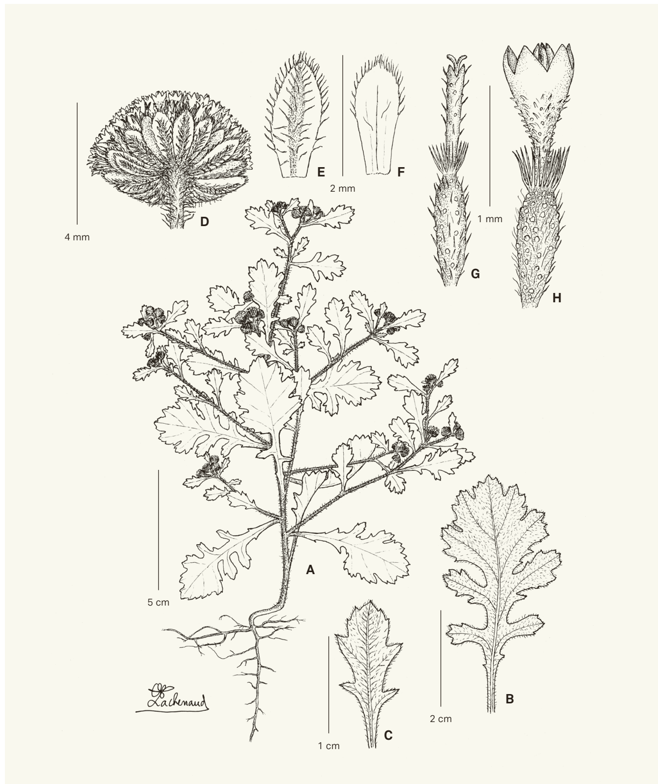
Fig. 2. – Grangea ogoouensis O. Lachenaud & Beentje. A. Plant in flower; B. Basal leaf; C. Upper leaf; D. Capitula; E. Outer phyllary; F. Inner phyllary; G. Outer (female) floret; H. Inner (hermaphrodite) floret. [Bidault et al. 1822, BR] [Drawing: O. Lachenaud]