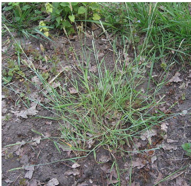
Alopecurus geniculatus L.

Water foxtail is a perennial, tufted grass that grows 20 to 50 cm tall. Plants are able to root at the lower stem nodes. Stems are numerous and erect to decumbent. Leaves are green to gray-green, flat, 2 to 7 mm wide, and 2 to 12 cm long with rough upper surfaces and short-hairy to nearly smooth lower surfaces. Ligules are rounded and 2 to 5 mm long with slightly toothed margins. Leaf sheaths are open. Panicles are pale green or purple-tinged, cylindrical, 2 to 7 cm long, and 3 to 7 mm wide. Spikelets are 3.2 mm long or less (excluding awns) and consist of one fertile floret. Glumes are 2.5 to 3.5 mm long and fringed with long hairs along the keels and nerves. Lemmas are oblong and 2.5 to 3.5 mm long with truncate apices. Awns are attached to lemmas 0.5 mm above the base. Awns are bent or twisted and 3.5 to 5 mm long, and they extend more than 1.5 mm beyond the glumes. Anthers are 1.2 to 2.2 mm long (Peeters 2004, Clayton et al. 2006, Crins 2007, Malyshev 2007, Klinkenberg 2010).