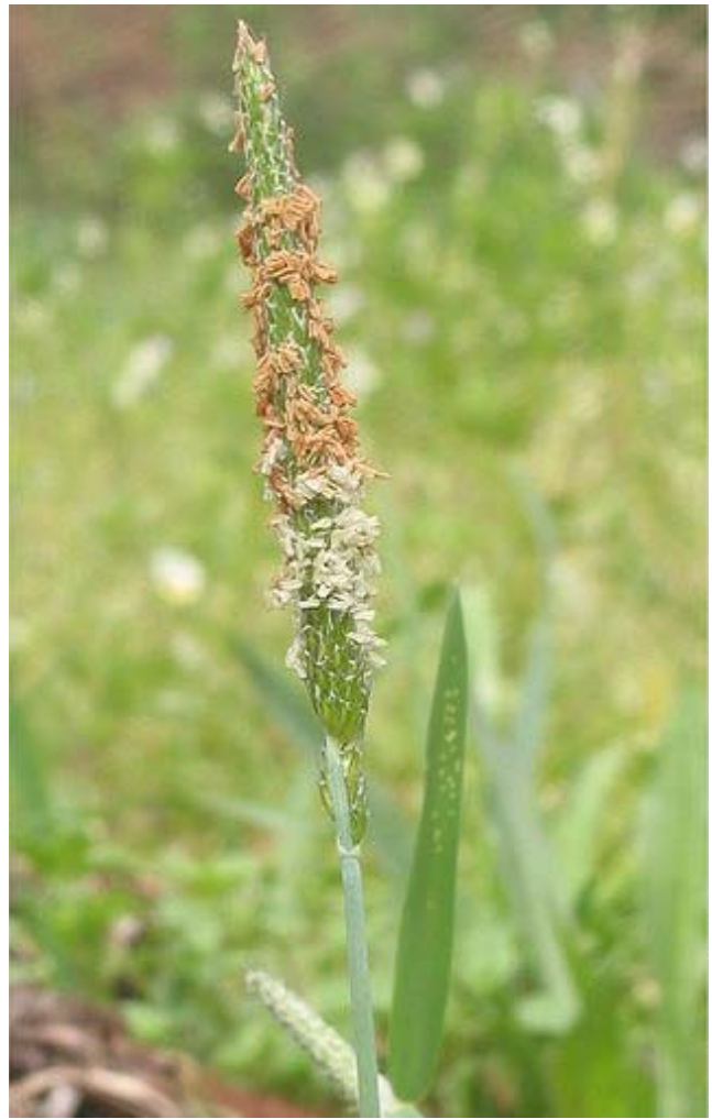
Panicle of Alopecurus geniculatus L.

Similar species: Several other Alopecurus species can be confused with water foxtail. The non-native meadow foxtail ( A. pratensis ) can be distinguished from water foxtail by the absence of creeping lower stems and longer spikelets that are 3 to 6 mm long (Hultén 1968, Klinkenberg 2010). Meadow foxtail also has broader panicles (6 to 10 mm wide) and longer anthers (3 to 3.5 mm long) than water foxtail (Peeters 2004). Two native