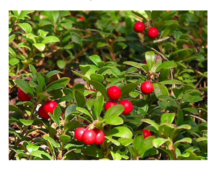
Arctostaphylos uva-ursi , Albany County

Arctostaphylos uva-ursi, Bearberry, is a slow growing, evergreen, mat forming shrub which can reach about 1 foot high but is usually only a few inches high. The leaves are dark green and shiny and often turn bronze or occasionally reddish in fall and winter. The inconspicuous white to pinkish flowers are only about ¼ inch long. The fruits are berry-like and bright red and remain on the plant until the birds get them. The plants occur naturally in moist woods and thickets in the mountains and foothills. It prefers moist but well drained soil and is tolerant of heat. wind, and salt. It does best in shade or part shade. Small plants are easy to transplant and it is easy to propagate from 6 inch stem cuttings in late summer. Trim the leaves from the lower third, dip ends in rooting hormone, and plant the ends 2 inches deep in peat moss and sand in equal parts. Mist regularly. Keeping them in a mostly closed clear plastic container or covering will help retain humidity. Once rooted (generally 6-8 weeks), put in pots of equal parts sand and loamy soil, mulch heavily, and store in a cold area for the winter. Plant out in the spring minimizing disturbance to the roots. It is also available in the nursery trade.