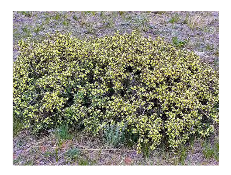
Purshia tridentata , Platte County

Purshia tridentata, Bitterbrush, is a deciduous shrub upto 3 feet high and wide. It has numerous, very fragrant, yellow flowers. It occurs naturally in moist to dry, open woods or on open slopes and meadows in the basins, valleys, and mountains. It prefers full sun or light shade and moist, well drained soil and is drought tolerant. It is difficult to transplant but can be grown from stem cuttings. Seed needs to be cold stratified for 90 days after all extraneous material is removed from the seed.