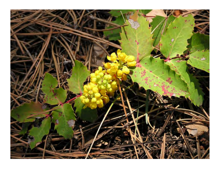
Mahonia repens, Albany County

Mahonia repens, Oregon Grape, is not really a grape but probably gets its common name from the blue fruits resembling a cluster of grapes. It is a creeping evergreen shrub 1 foot tall or less. The leaves resemble a holly and often turn red or bronze during the winter. The yellow flowers are small but in dense clusters in the leaf axils. It occurs naturally in moist, wooded or partly open areas in the mountains and higher basins. It does best in part shade in a moist, well drained soil and can tolerate some drying. It can be grown from rhizome cuttings taken in spring. Seed needs to be cold stratified for 90 days and surface sown but germination may take upto 2 years. It is also in the nursery trade.