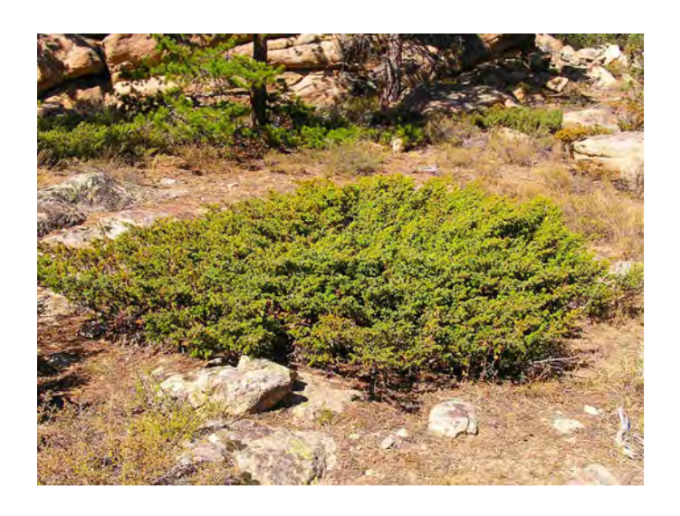
Juniperus communis, Albany County

winter the leaves may get a reddish-bronze tint, especially in full sun. These grow vigorously but can be pruned back. There are several cultivars in the nursery trade, some derived from outside our area. Ours is variety depressa . It can also be grown from stem cuttings with a short strip of bark at the base. Small specimens are easily transplanted. Seed requires 60 to 90 days warm stratification followed by 90 days cold stratification. Surface sow to allow light exposure. A shorter creeping juniper, Juniperus horizontalis , seldom gets over 6 inches high and is a good ground cover.