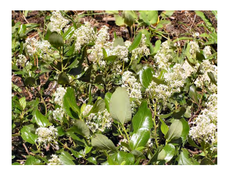
Ceanothus velutinus, Carbon County

Ceanothus velutinus, Big Buckbrush, is an evergreen shrub to 3 feet (rarely 6 feet) high and often forms large dense colonies. The leaves are fragrant and the upper surface appears like it is The white flowers are tiny but are aggregated into large, showy clusters at the ends of the branches. It occurs naturally in moist to dry open woods or open areas in the mountains. It requires good drainage in full sun and does not tolerate overwatering nor highly alkaline soils. It can be propagated from 2 or 3 inch branch tip cuttings in late summer dipped in rooting hormone. Provide bottom heat to the pots or flats (70-80° F). Growing from seed is a little tricky. Collect the seed just before the capsules open. Put the capsules into a paper bag immediately. The seeds fly out when the capsule splits. Bring some water to a near boil, turn off the heat, put in the seeds, and leave until the water cools. Then cold stratify for 60 days or more and surface sow. It may take 100 days or more for germination.