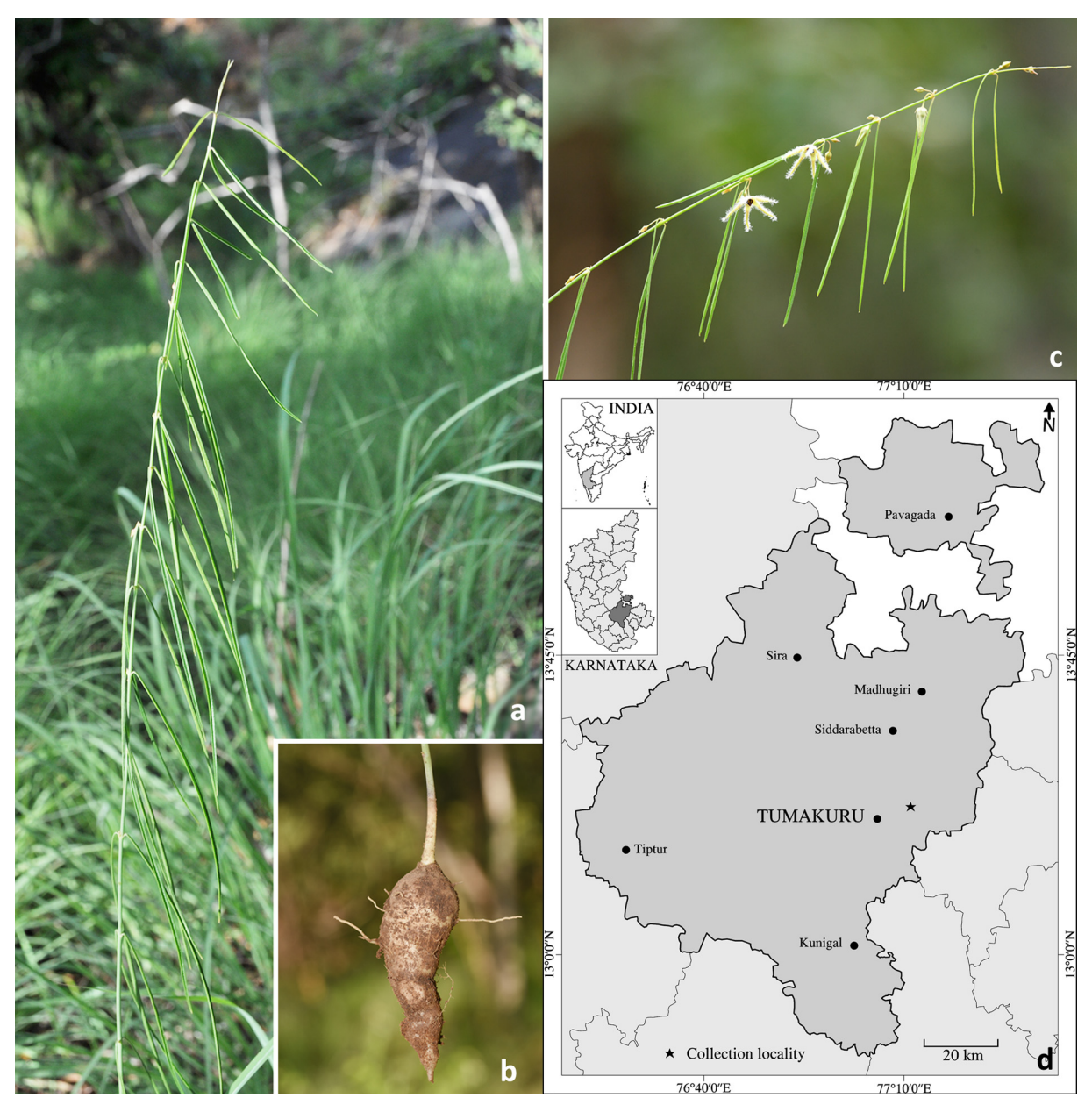
Fig. 1. Brachystelma tumakurense Gundappa, Sringesw., Vishwan. & Venu sp. nov. a. Habit; b. Tuber; c. Part of flowering stem; d. Map showing collection locality (map from Survey of India; photos by A.N. Sringeswara).

Type : INDIA, Karnataka , Tumakuru district, Devarayanadurga, near Namada chilume, 700 m, 30.07.2017, B.V. Gundappa & V. Bhaskar 2546 (holo UASB!; iso BSI!).